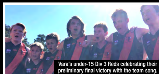
Vara's under-15 Div 3 Reds celebrating their preliminary final victory with the team song.

Best — Vara President – Manly Bombers JAF C