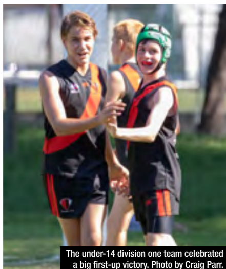
The under-14 division one team celebrated a big first-up victory.