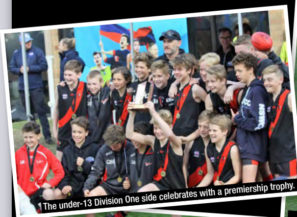
The under-13 Division One side celebrates with a premiership trophy.