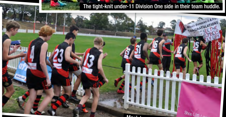
Manly's under-15s run out on Olds Parks.