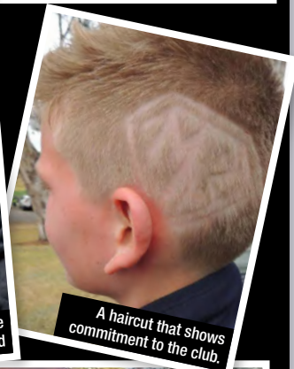
A haircut that shows commitment to the club.