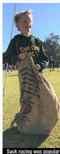
Sack racing was popular