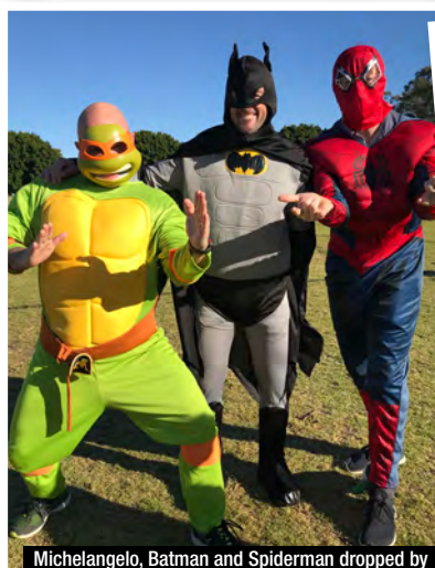
Michelangelo, Batman and Spiderman dropped by