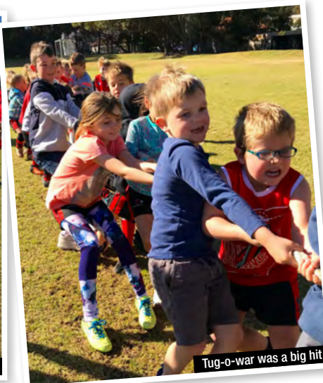
Tug-o-war was a big hit