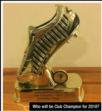
Who will be Club Champion for 2018?

One of the highlights of the Manly Bombers JAFC calendar is the annual presentation day, which is to take place at Freshwater Surf Life Saving Club on Sunday September 16.