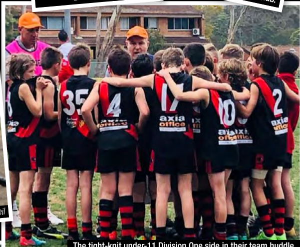
The tight-knit under-11 Division One side in their team huddle.