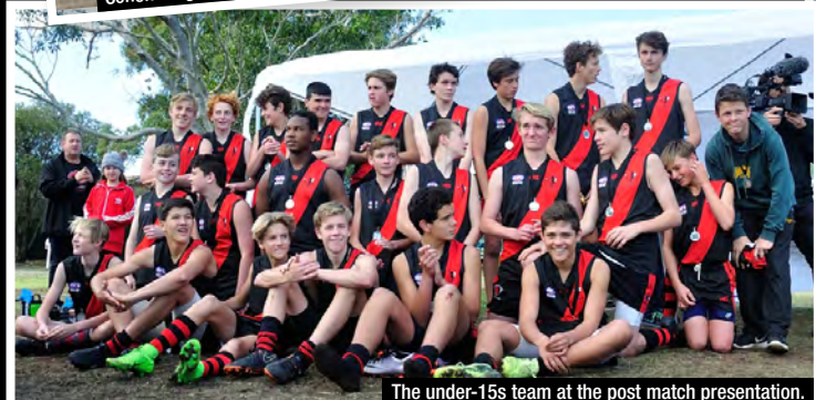
The under-15s team at the post match presentation.