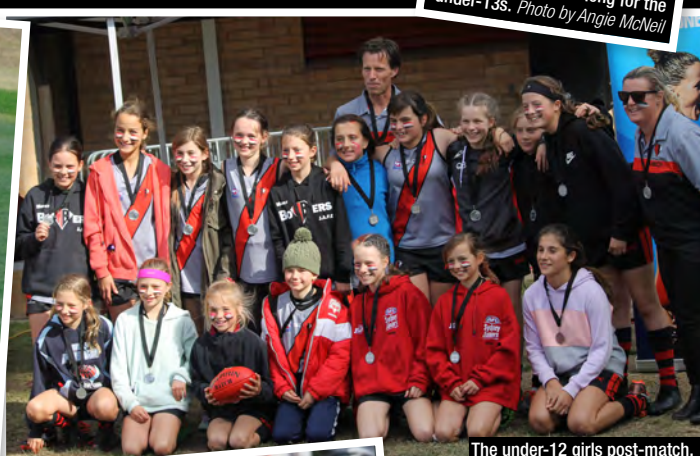
The under-12 girls post-match.