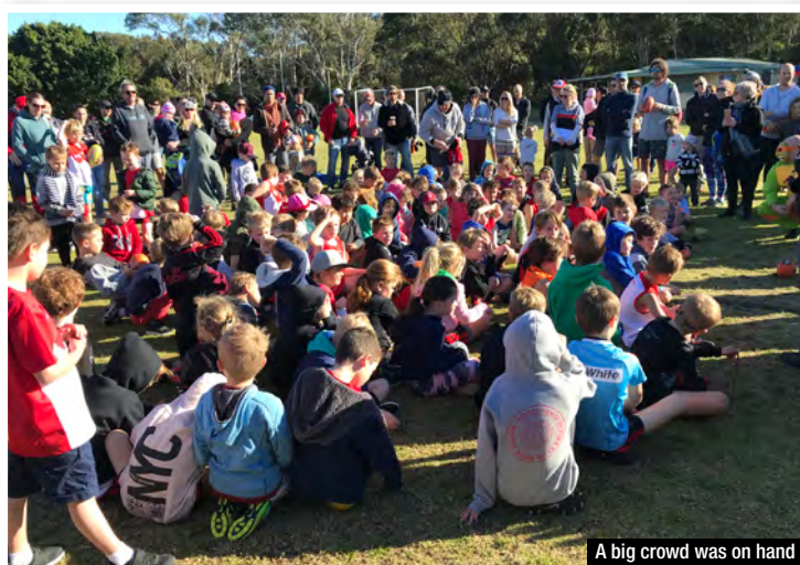
A big crowd was on hand

Thanks again to all of our coaches, age managers and parent-helpers for their support this season. We look forward to seeing our under-6 and under-7 families again in season 2019.