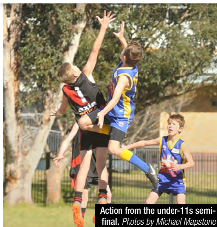
Action from the under-11s semi-final.