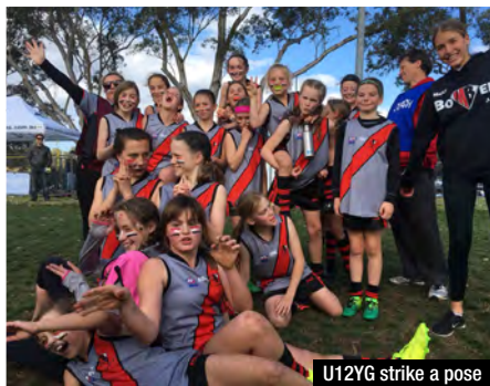
U12YG strike a pose

Here's a rundown on how things panned out for each of our finals sides: