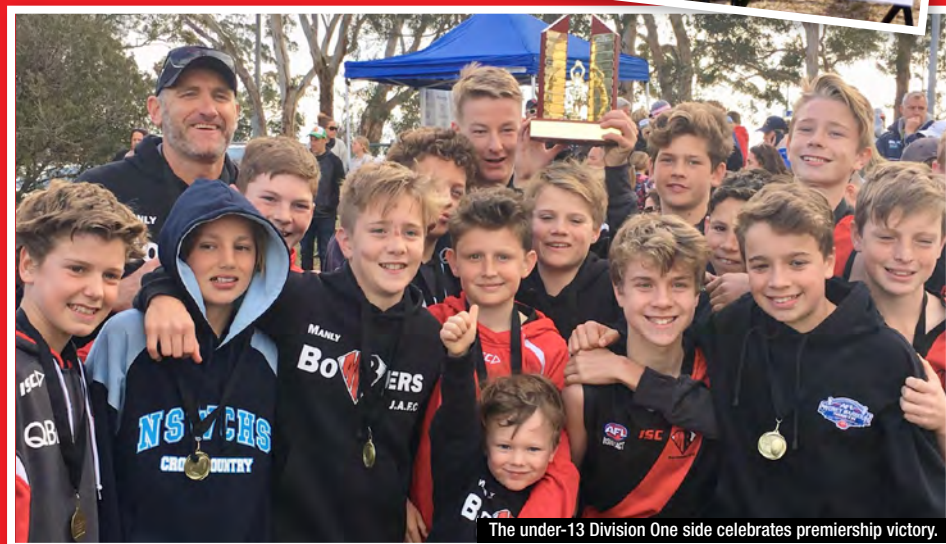
The under-13 Division One side celebrates premierships victory.